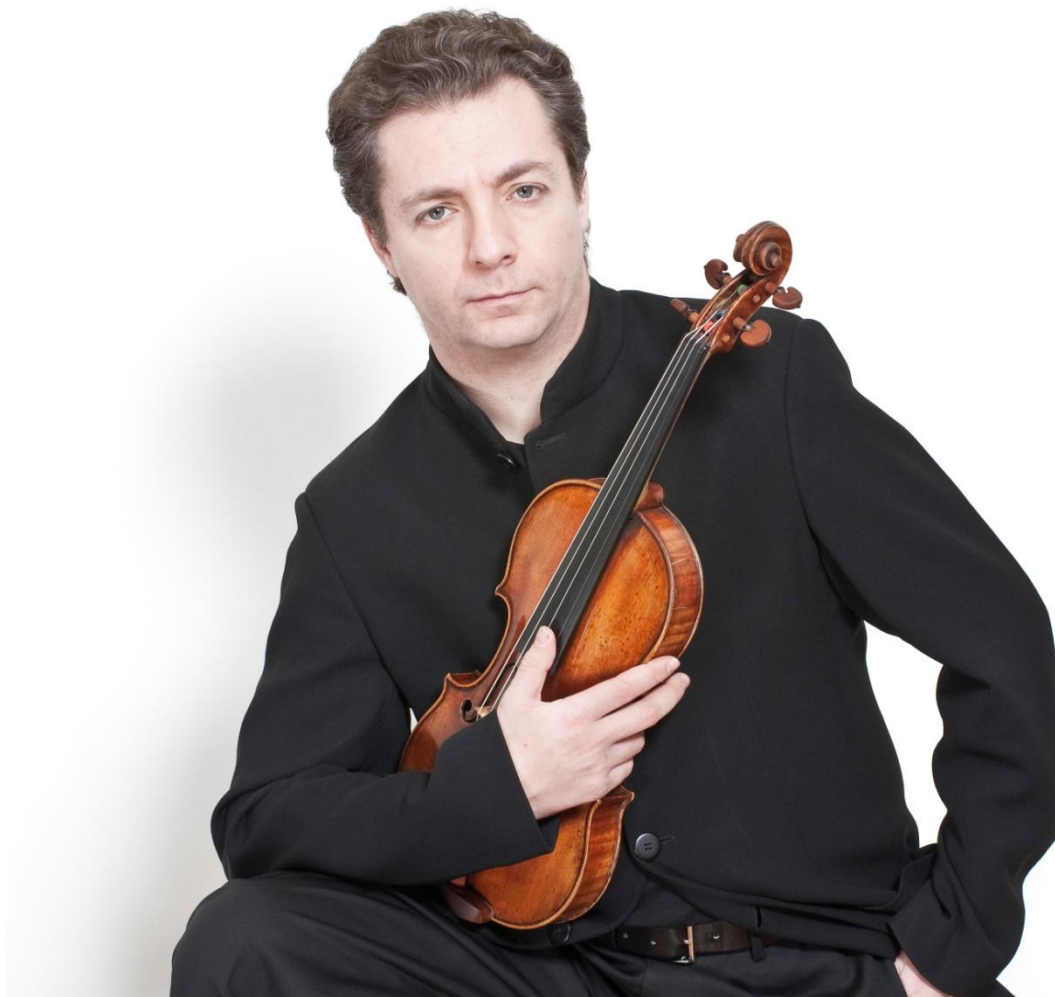
Pavel Berman, violinist

The cost of the masterclass - i.e. inclusive of the membership fee for the Polifonie Cultural Association, lessons attendance, pianist accompanist, board and lodging at affiliated hotel structures - is 690 € per person. In case you want to participate only for lessons (excluding board and lodging) the cost is € 400 per person.